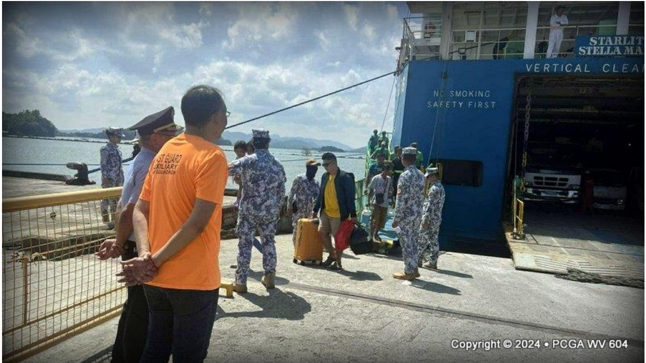
Copyright © 2024 • PCGA WV 604