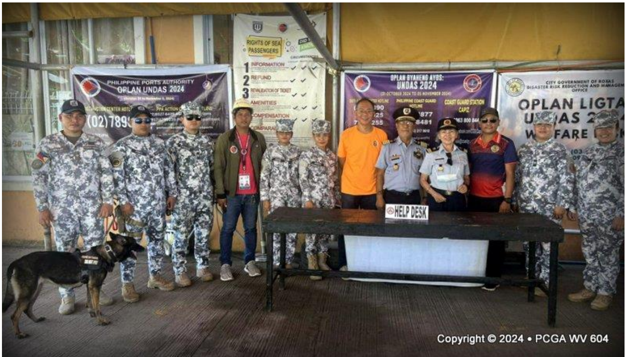
Copyright © 2024 • PCGA WV 604