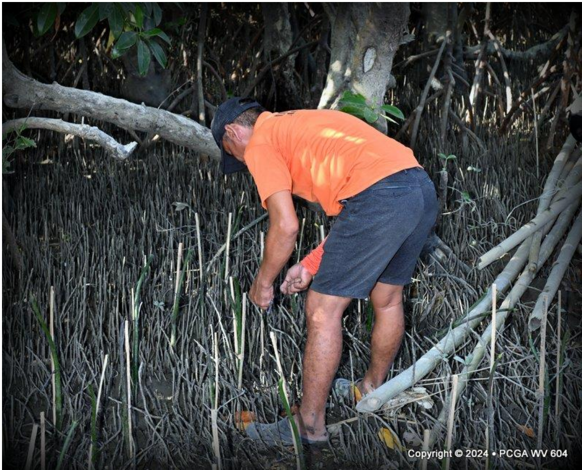
PCGA member planting