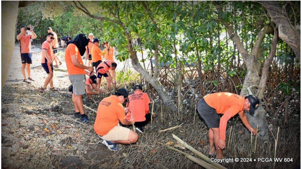
PCG and PCGA mangrove planting participants