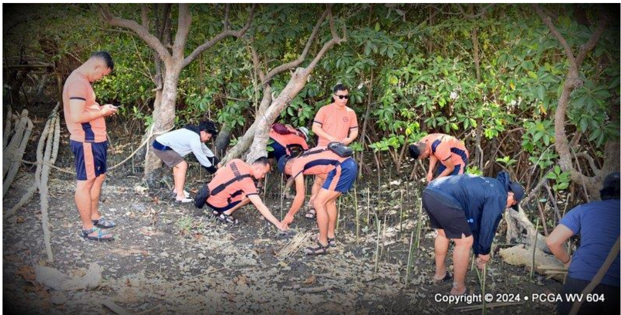
PCG members planting