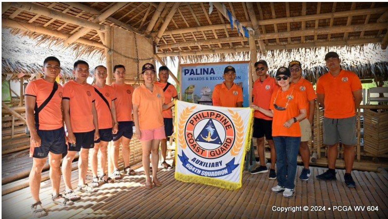
PCG and PCGA mangrove planting participants