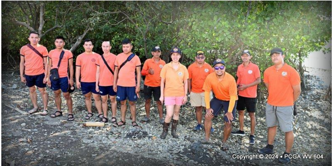
PCG and PCGA mangrove planting participants