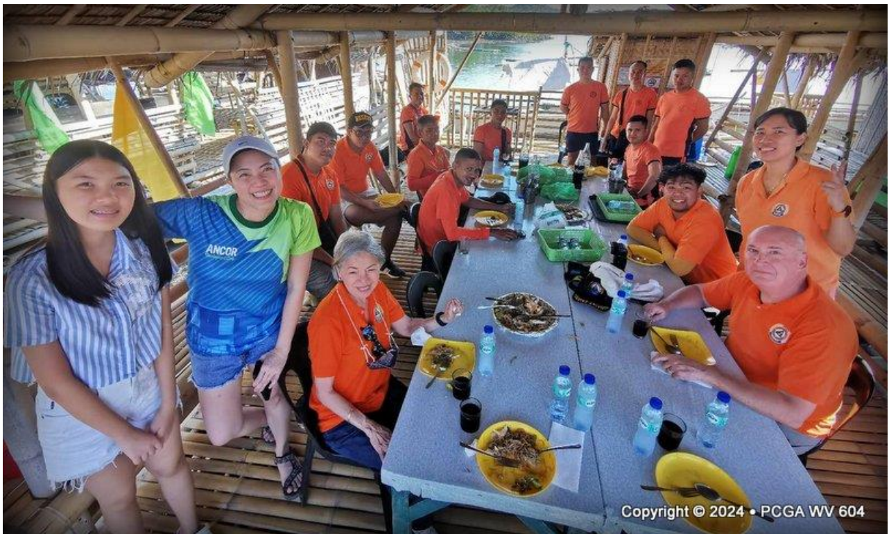
PCG and PCGA mangrove planting participants