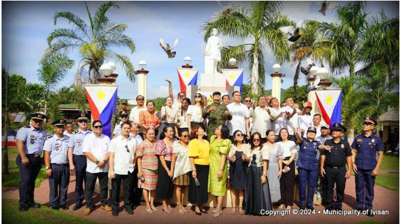
Ceremonial release of doves at the statue of Dr. Jose P. Rizal