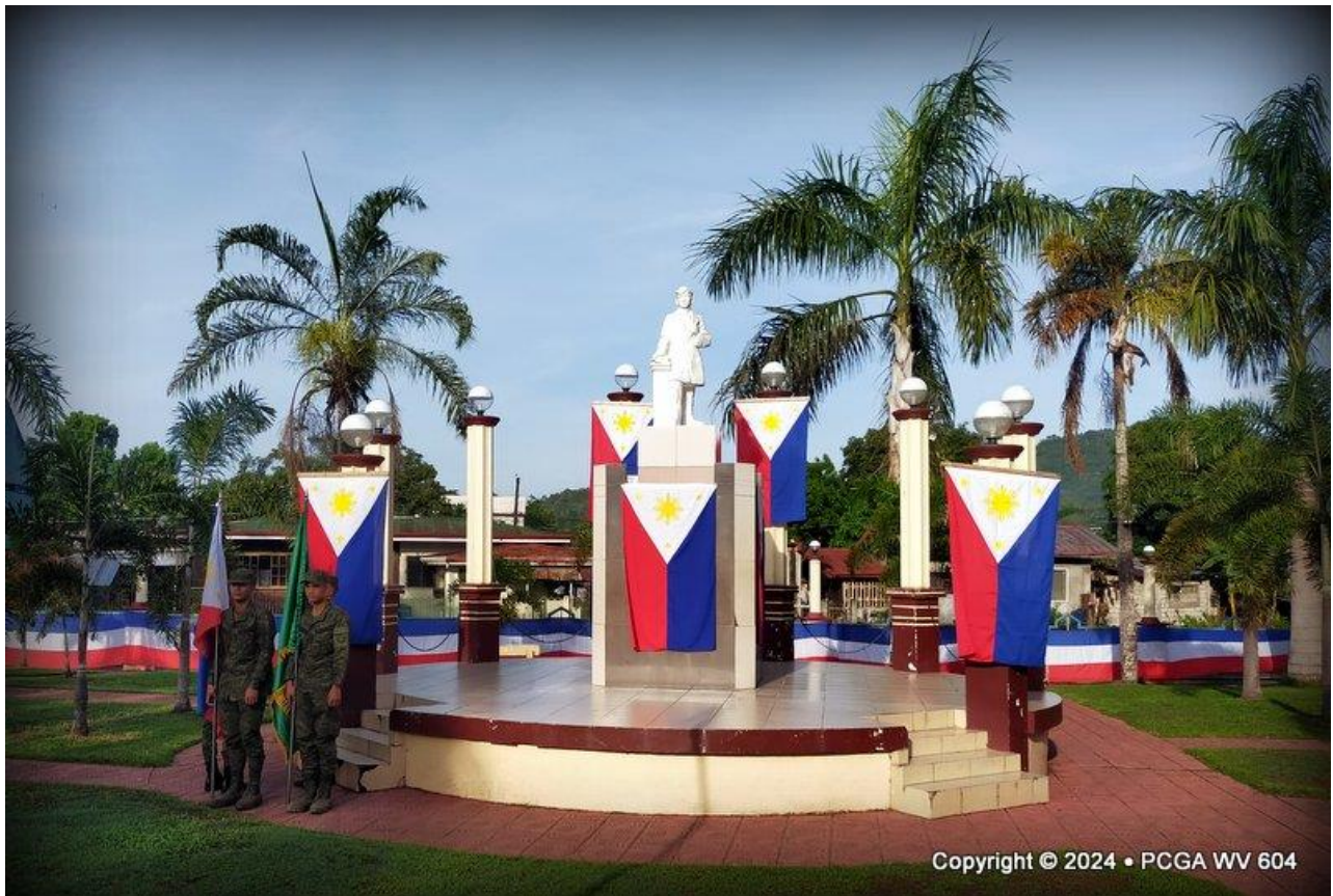
Statue of Dr. Jose P. Rizal