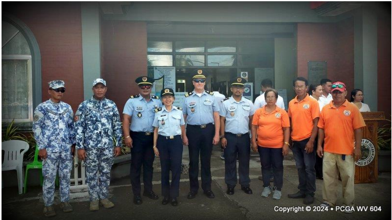
Members of CGSS Ivisan, 604 th CGAS, and 604.2 CGADiv.