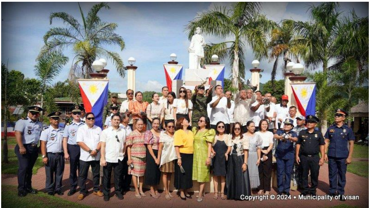
Ceremonial release of doves at the statue of Dr. Jose P. Rizal